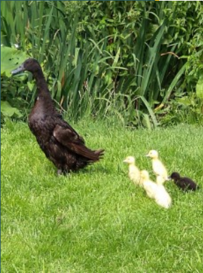
A wild duck with ducklings by the Weedon pond

The Park is owned and managed by the Parish Council. Contractors do grass and hedge cutting and path weeding.