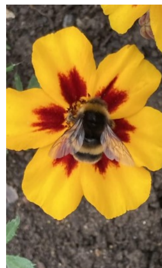
Another Janet Fincher picture

Email is used for community interest information.