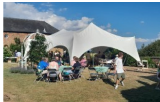
WVA Summer Party 2025

arranges a variety of functions to suit all ages and tastes. Last year's Summer Ball was a resounding success, and provided funds for a free village Summer Party in both 2024 and 2025.