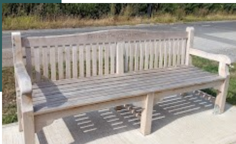
The WVA bench at The View

The PC looks after public seats and benches around the village.